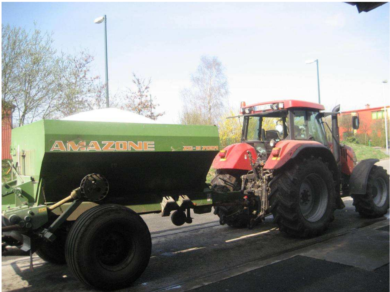
Picture 2: German farmer with Urea pastilles are willing to pay premium prices

In December 2007, trials involving the addition of elementary sulphur (8%) to the urea melt were successfully carried out on a commercial Rotoform line at Yara Brunsbüttel in Germany and the quality of the S-Urea pastilles is very good. The Rotoform plant at Yara has been also used for production of fertilizer urea and technical urea, which quality has been very much appreciated by the German farmers en even worth a premium price as the hardness and size was better than prills and the pastilles did not show any caking problems.