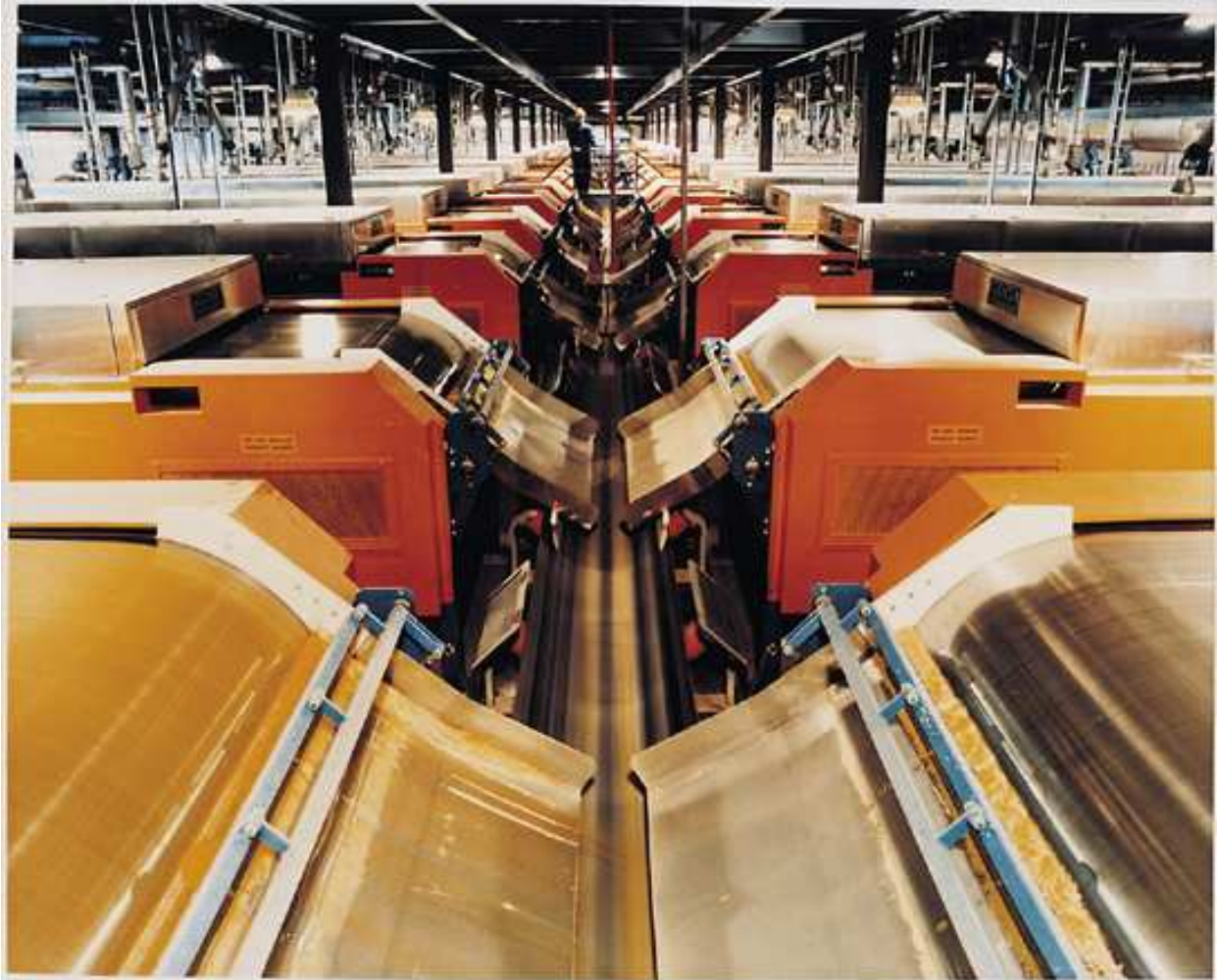
Picture 3: Shell Canada has 46 Rotoformer lines in operation producing 6000 mtpd during 365 days a year

More than 450 Sulphur Rotformer lines are in operation, also in large scale applications. For example Shell Canada has 46 lines in operation in parallel since 1993 producing 6000 mt/day during 365 days a year !